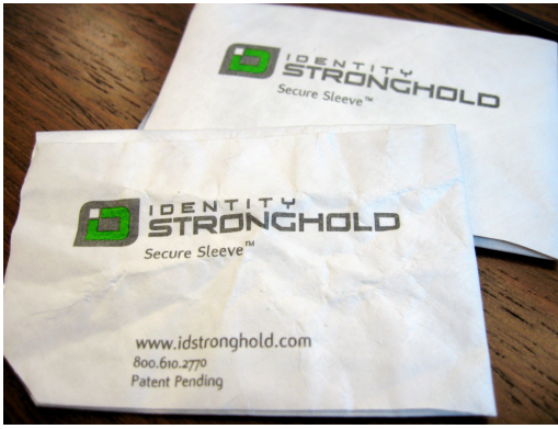
Figure 1: The sleeves used for our shielded distance tests. The crumpled sleeve is in the foreground, with the new sleeve behind it.

able operational range of tens of feet [39], read ranges can vary considerably as a function of the material to which a tag is affixed, the configuration of the interrogating reader, and the physical characteristics of the ambient scanning environment.