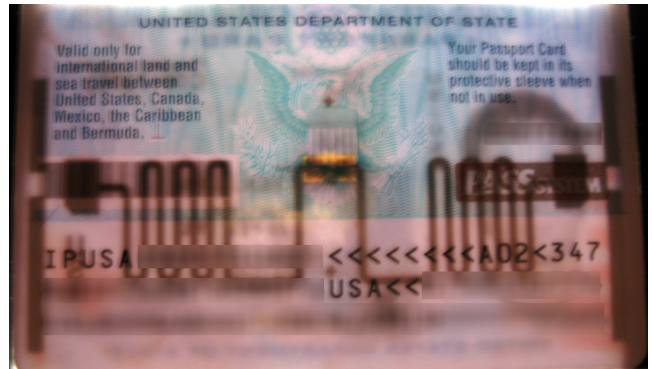
Figure 3: The antenna inside a Passport Card. Certain personally-identifiable information has been obscured.

The experiment we conducted was done in a very noisy environment, consisted of multiple readers interfering with each other giving very inconsistent readings (Figure 1). Setup was fairly simple. We had a single tag that was being probed in clear line of sight. Our first goal was to determine if there was any meaning that could be extracted from these erratic readings. Given the setup above, we took n number of readings and recorded those values. Afterward we kept on shifting the tag few centimeters at a time and recording those values as well. The results were as following. Taking the average of values for each of the measurements revealed interesting results. We were able to effectively determine relative distance based on the averaged RSSI readings.